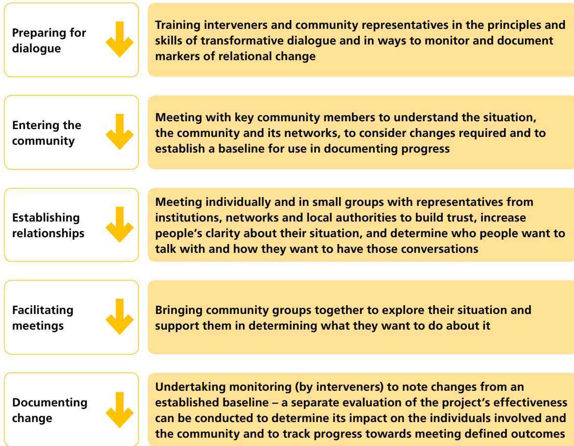
Figure 1: Activities involved in transformative dialogue